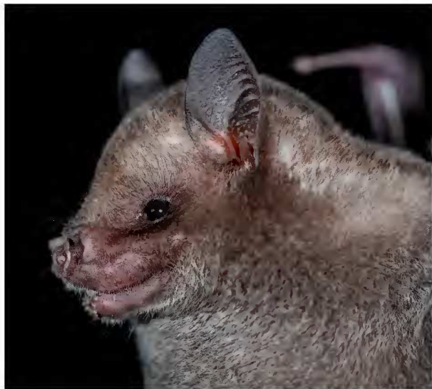
Figure 4. Photograph of a female Brachyphylla cavernarum taken from a mango tree near the F. D. Roosevelt Airport on the island of St. Eustatius. Note the greatly reduced nose-leaf and gray coloration characteristic of this species.

Martinique confirming the placement of St. Eustatius individuals in the nominate subspecies. Individuals from St. Eustatius and Barbuda averaged among the largest in measurements for the subspecies. Carstens et al. (2004) examined the genetic structure of northern Lesser Antillean populations of B. cavernarum , and they included two individuals collected from St. Eustatius in their analyses. Their results showed low genetic diversity (within the mitochondrial cytochrome- b gene) across the islands of St. Maarten, St. Eustatius, Saba, Nevis, and Montserrat. The two individuals examined from St. Eustatius differed by a single nucleotide in cyt-b sequences and these haplotypes were identified on neighboring islands (Carstens et al. 2004). Despite the lack of genetic structure observed in cyt-b gene variation, we recommend additional genetic analyses, perhaps using advanced genetic approaches appropriate for population-level genetic resolution (for example, high-throughput Restriction site Associated DNA Sequencing; RAD-seq), of Caribbean populations of B. cavernarum .